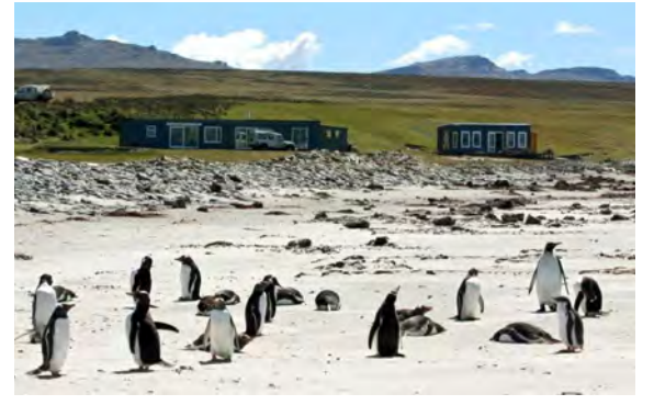
BLUFF COVE PENGUIN ROOKERY Port: Stanley, Falkland Islands Activity Level: Moderate

See playful penguins, glimpse rare wildlife and learn to dance the tango in the place of its birth. Visit the Falkland Islands' Bluff Cove Penguin Rookery, where gentoo penguins frolic and feed on the edge of this South American wonderland that is home to more penguins than people! Gaze in wonder at Torres del Paine National Park's bright blue icebergs and golden grasslands and keep watch for its llama-like guanacos. Indulge your passions in Buenos Aires, birthplace of the bewitching tango, as you take in a thrilling performance.