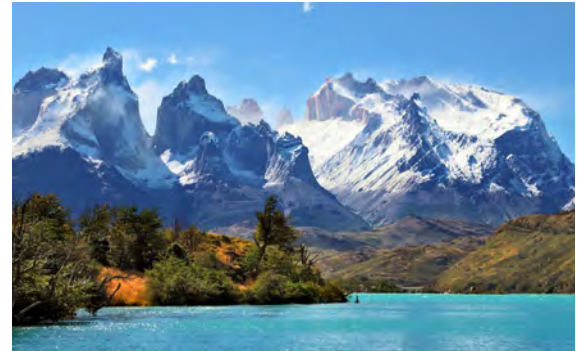
TORRES DEL PAINE NATIONAL PARK Port: Punta Arenas. Chile Activity Level: Moderate