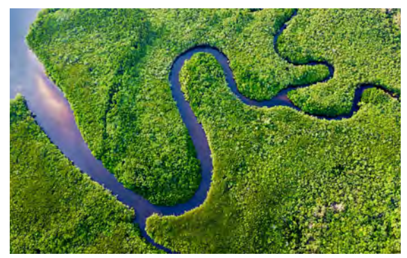
DAINTREE NATIONAL PARK Port: Cairns, Australia Activity Level: Moderate