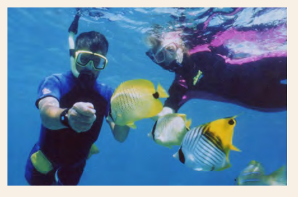
TAHITI LAGOON DISCOVERY Port: Papeete, Tahiti Activity Level: Moderate