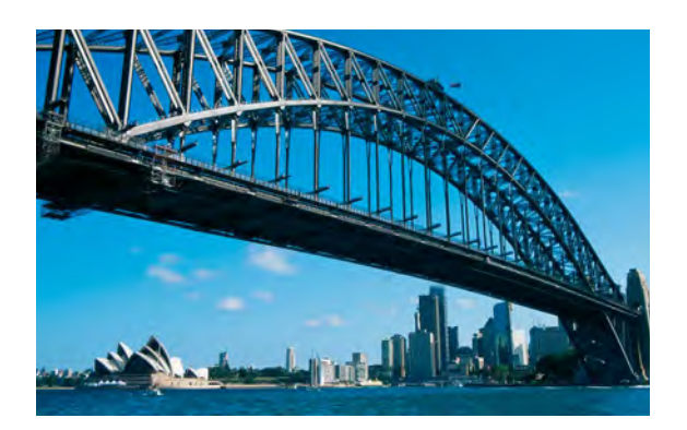
SYDNEY HARBOUR BRIDGE Port: Sydney, Australia Activity Level: Strenuous