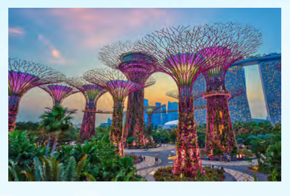
A NIGHT OUT IN SINGAPORE PORT: Singapore, Republic of Singapore Activity Level: Moderate

TOKYO CITY LANDMARKS Port: Tokyo, Japan Activity Level: Moderate