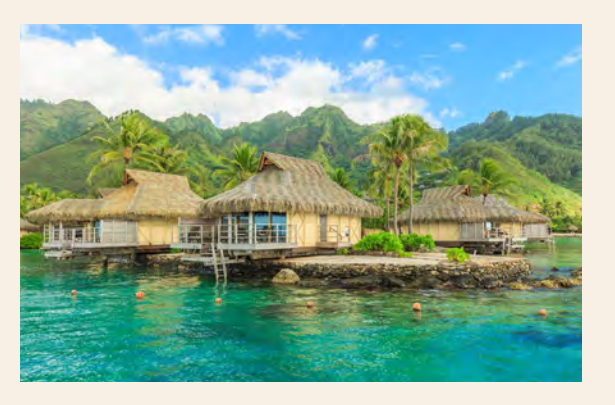
LOTUS OVER-WATER DINING Port: Papeete, Tahiti Activity Level: Easy

Dive deeper into Tahiti's waterside vistas and intriguing marine life. Savor a taste of South Pacific splendor in one of the region's iconic over-water bungalows. Sip Champagne as the Tahitian sun sets over the ocean in shades of fuchsia, mauve and periwinkle. Experience the island's kaleidoscope of tropical fish, vibrant coral reefs and friendly dolphins as you sail into the heart of one of Tahiti's stunning lagoons.