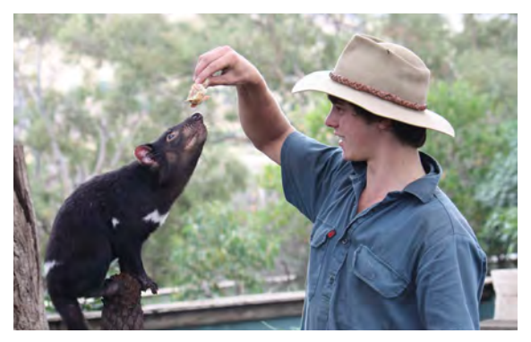
TASMANIAN DEVIL UNZOO Port: Port Arthur, Australia Activity Level: Easy

LORD OF THE RINGS TOUR Port: Wellington, New Zealand Activity Level: Moderate