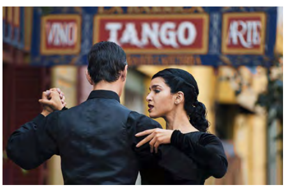
TANGO: A NIGHT OF PASSION & DESIRE Port: Buenos Aires, Argentina Activity Level: Easy