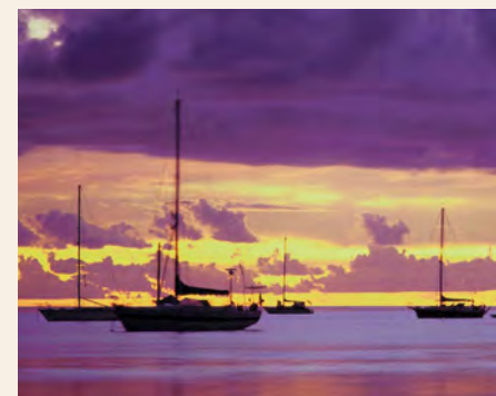
SUNSET SAIL Port: Papeete, Tahiti Activity Level: Easy