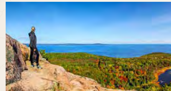
Take in coastal Canadian views