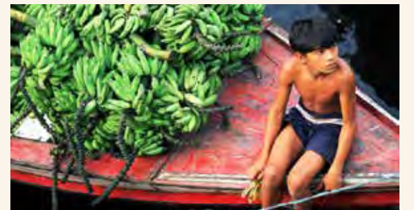
Encounter friendly locals