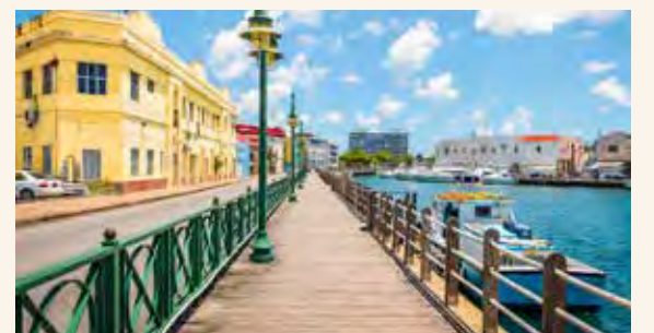
Explore historic Bridgetown, Barbados