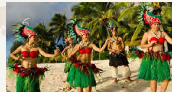
Immerse yourself in island traditions