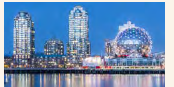
Vibrant Vancouver, British Columbia

VISIT HOLLANDAMERICA.COM OR CONTACT YOUR TRAVEL CONSULTANT TODAY.