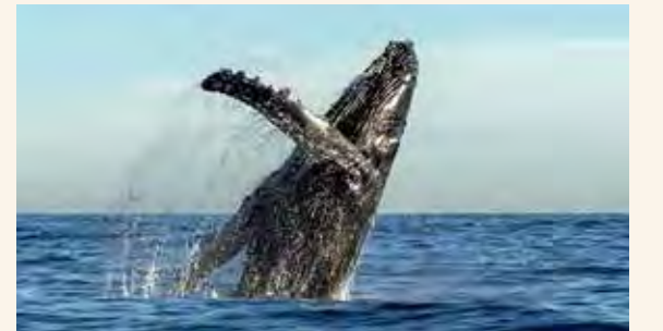
Witness marvelous marine mammals