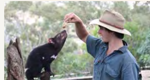
Meet Tasmania's famous devils

Encounter amazing wildlife, world-renowned wines and the jaw-dropping Great Barrier Reef as you circle Australia.