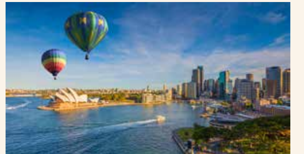
Sail spectacular Sydney Harbour