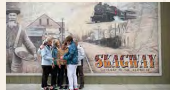
Experience frontier living in Skagway, Alaska