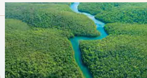
Sail the storied Amazon River