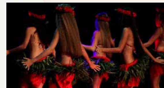
Experience local cultures