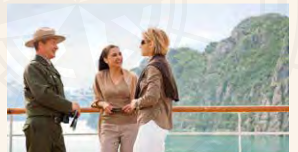
Onboard experts help you delve deeper