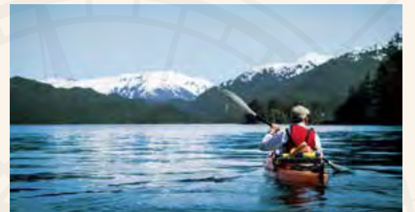
Kayak through pristine waterways