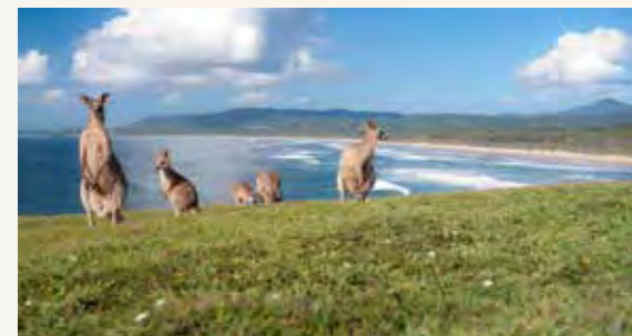
Kick back on Kangaroo Island