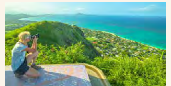
Survey tropical forests