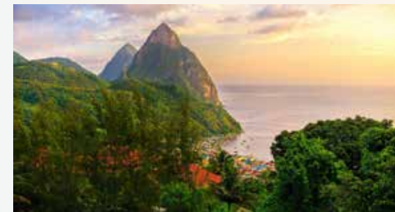
Marvel at St. Lucia's towering Pitons

Sail open seas and a storied river on this spectacular voyage from the Caribbean Islands to the Amazon rain forest and back.