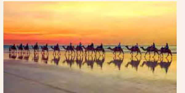
Enjoy a sunset camel ride in Broome