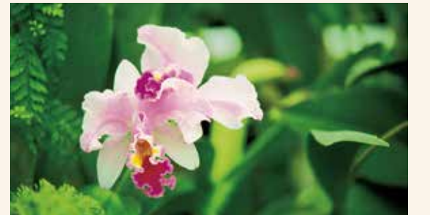
Breathe in beautiful native flora