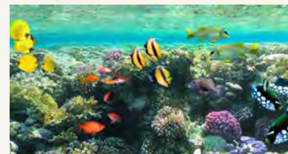
Uncover an underwater world