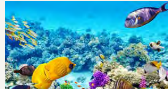
See the brilliant Great Barrier Reef