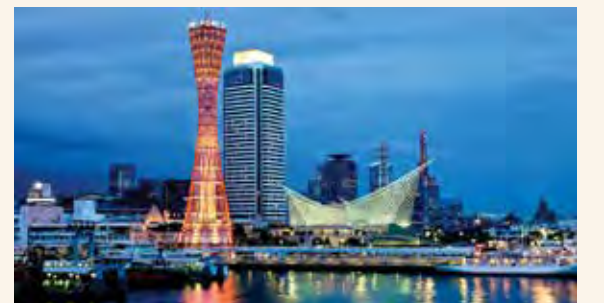
Marvel at modern architecture