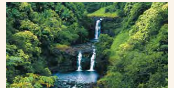
Unique and beautiful Umauma Falls