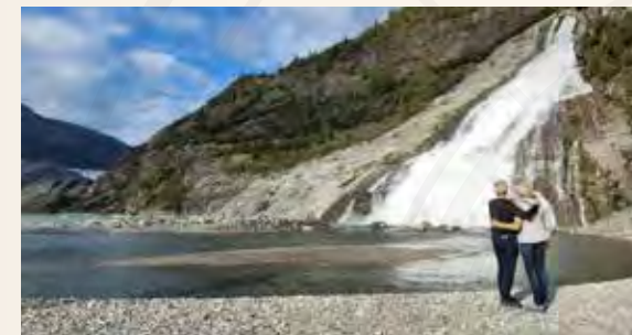
Nugget Falls, Tracy Arm Fjord, Alaska