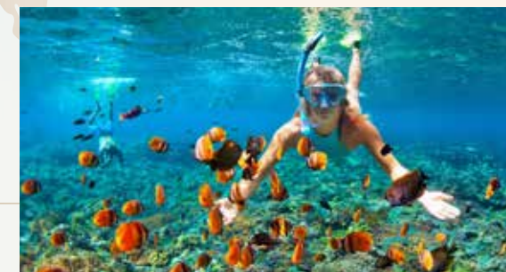
Get close to sea life