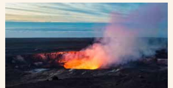
Kilauea Volcano, Hawaii

Evening Stay. Departure between 10:00 p.m. and midnight. Extended Stay. Departure leaving the next calendar day.