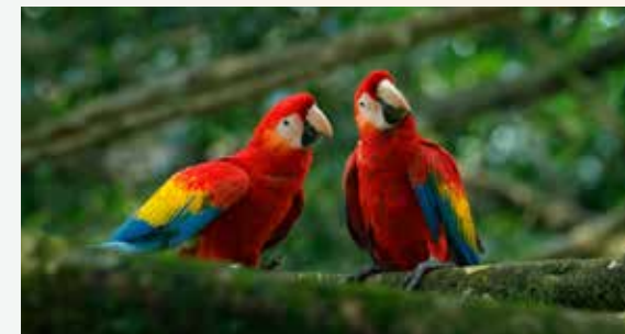
Delight in Amazonian wildlife