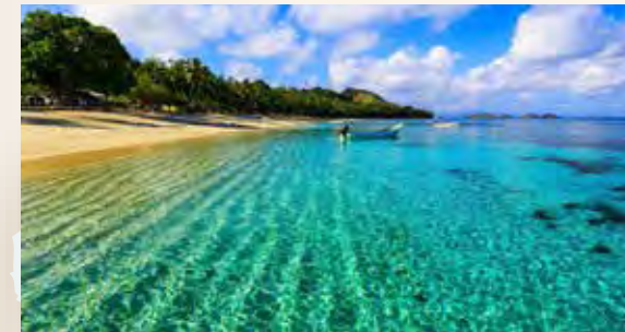
Refreshing turquoise water

Stroll pristine white- and black-sand beaches, swim with sea turtles, and marvel at kaleidoscopic coral reefs as you cross the Pacific Ocean.