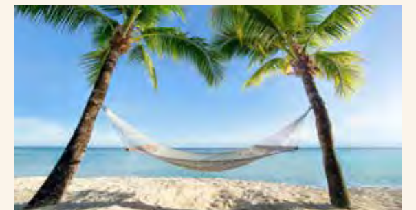
Wind down underneath palm trees