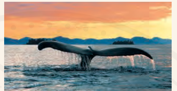
Keep watch for whales