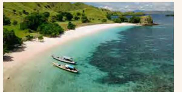
Marvel at Komodo Island's fierce reptiles

Evening Stay. Departure between 10:00 p.m. and midnight. Extended Stay. Departure leaving the next calendar day.