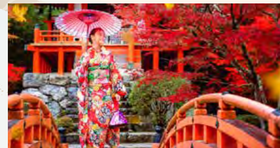
Autumn in Kyoto, Japan