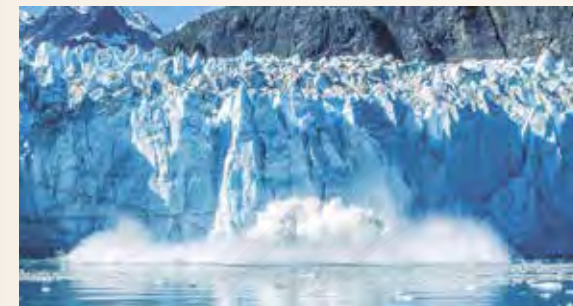
Glacier Bay National Park, Alaska

Spend the Summer Solstice at the Arctic Circle while cruising your way through Alaska's perennial favorites and hidden treasures.