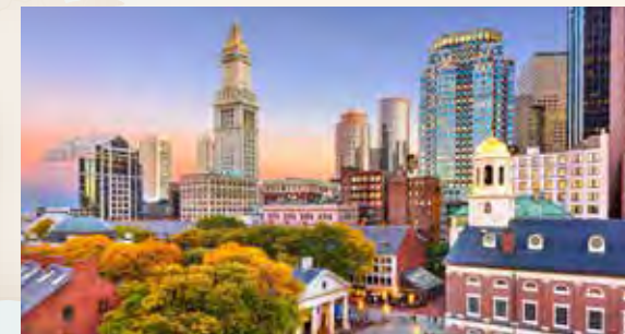
Explore historic Boston, Massachusetts