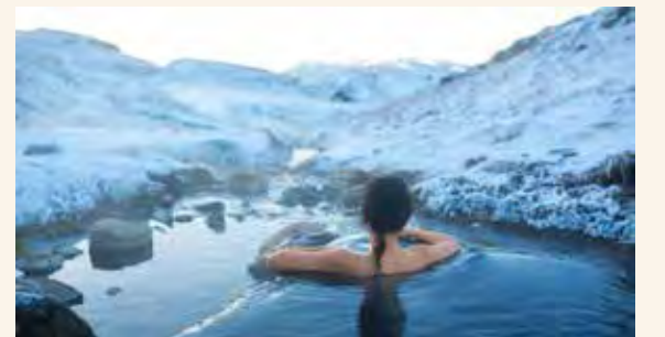
Immerse yourself in Iceland's majestic fjords