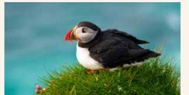
Admire colorful puffins at play