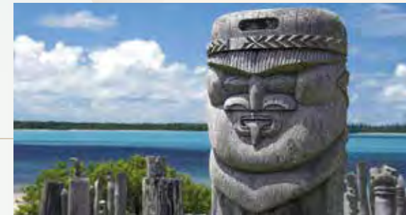
Ancient figure, New Caledonia