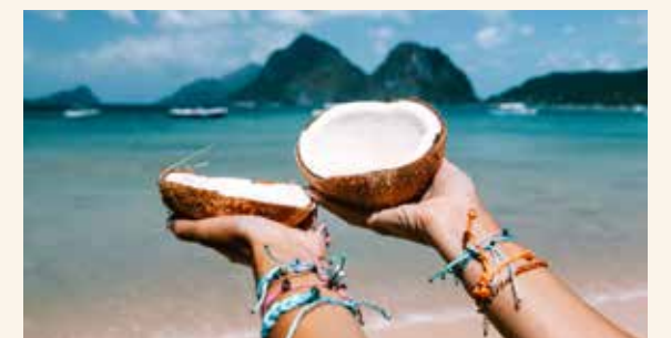
Sample a taste of local fruit