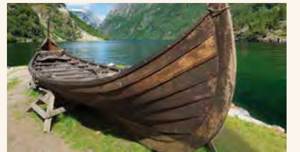
See perfectly preserved Viking artifacts