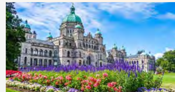
Charming Victoria, British Columbia