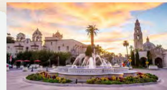
Balboa Park, San Diego