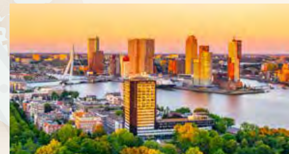
Visit our hometown of Rotterdam, the Netherlands