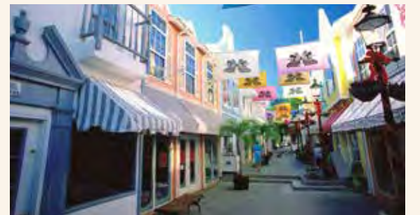
Visit Dutch-flavored St. Maarten