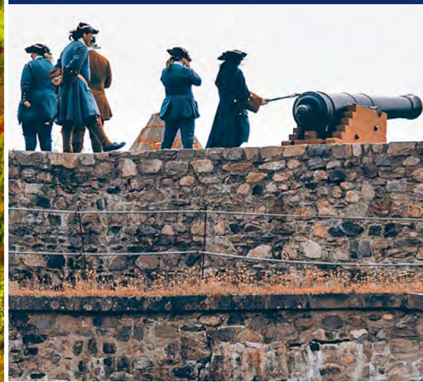
Cape Breton, Nova Scotia