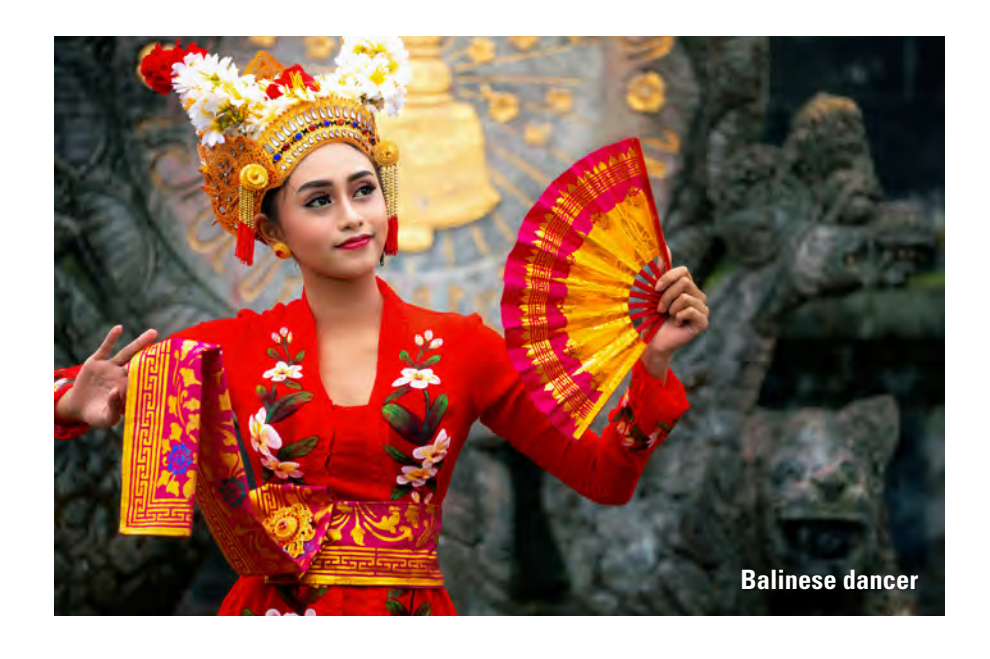
VISIT HOLLANDAMERICA.COM OR CONTACT YOUR TRAVEL ADVISOR OR PERSONAL CRUISE CONSULTANT TODAY.

This Filipino port boasts stunning natural beauty and the UNESCO-listed Subterranean River National Park.