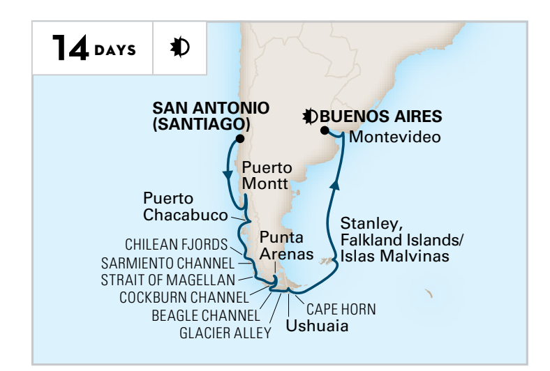
SOUTH AMERICA PASSAGE SAN ANTONIO (SANTIAGO) TO BUENOS AIRES Oosterdam 2026: Feb 22 2025: Dec 4

Experience South America's jaw-dropping natural wonders. Enjoy scenic cruising through the iconic Chilean Fjords, Drake Passage, and Cape Horn as well as lesstraveled waterways such as Glacier Alley and the Cockburn and Beagle Channels. Marvel at Patagonia's stunning mountains, glaciers, volcanoes, and waterfalls or explore Torres del Paine National Park and Perito Moreno Glacier on an in-depth overland tour. Keep watch for wildlife on board and ride horseback through the countryside, fly-fish the Andean fjords, visit the world's largest Magellan penguin colony, and so much more on shore.