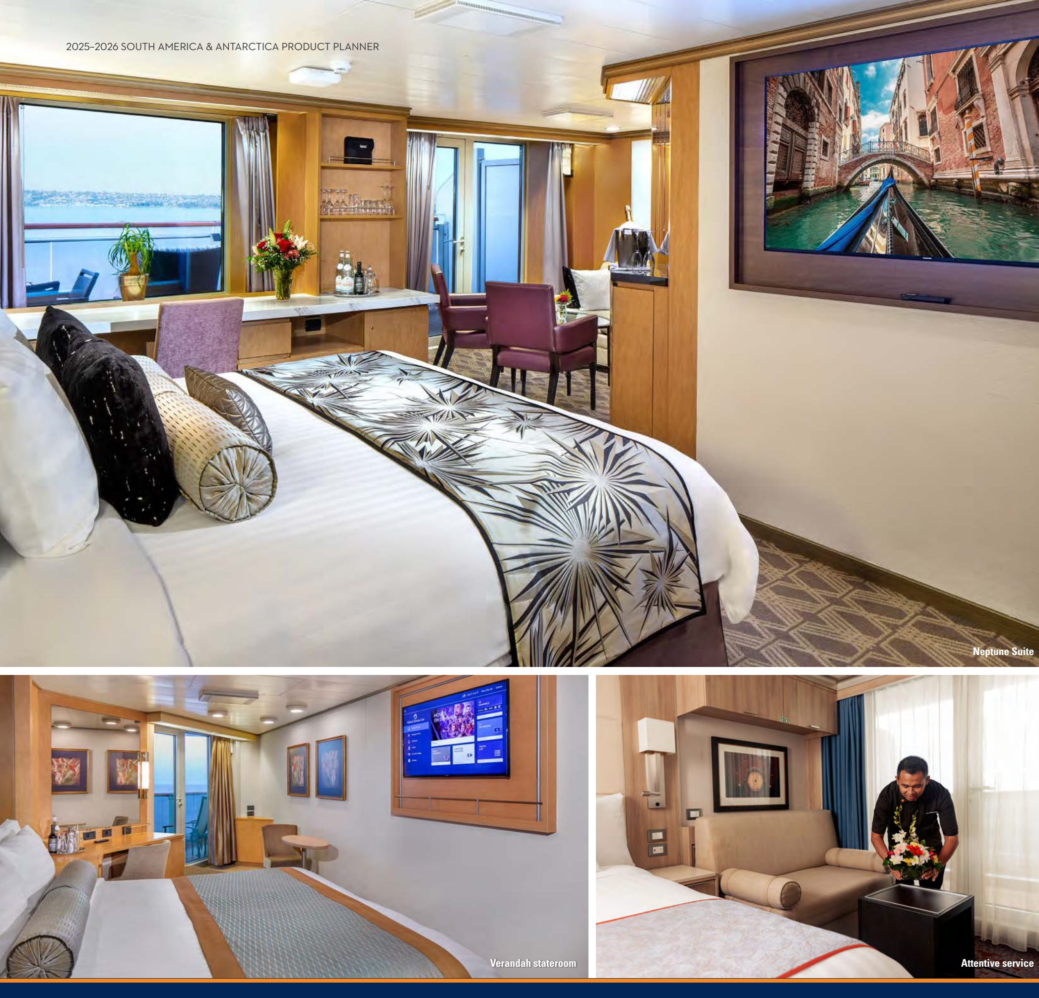
VISIT HOLLANDAMERICA.COM OR CONTACT YOUR TRAVEL ADVISOR OR PERSONAL CRUISE CONSULTANT TODAY.