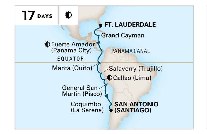
PANAMA CANAL & INCA DISCOVERY FT. LAUDERDALE TO SAN ANTONIO (SANTIAGO) Oosterdam 2025: Nov 17

Experience an engineering marvel, call on South American capitals, and venture on an unforgettable overland adventure to Machu Picchu, the Galápagos Islands, or both. This sweeping journey either departs from or arrives in Ft. Lauderdale, making it easy to explore some of the world's most enthralling destinations from your doorstep. Transit the pioneering Panama Canal, keeping watch for sloths, monkeys, toucans and more. An overnight stay in Fuerte Amador (Panama City) and two in Callao (Lima) let you delve deeply into these charismatic capitals' unique local charm.