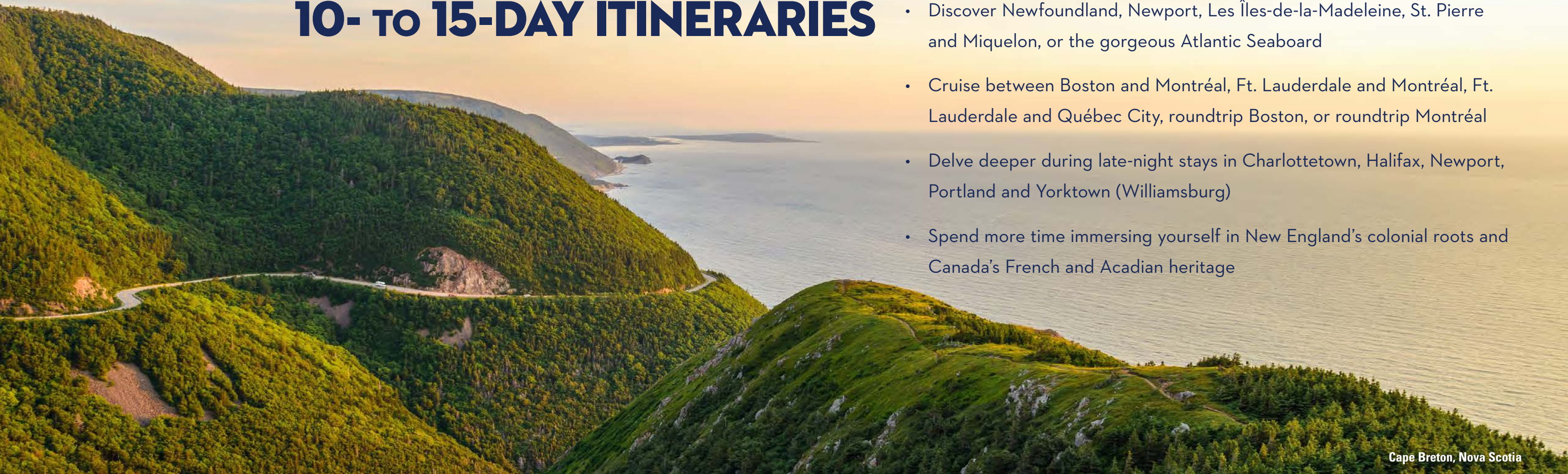
Cape Breton, Nova Scotia