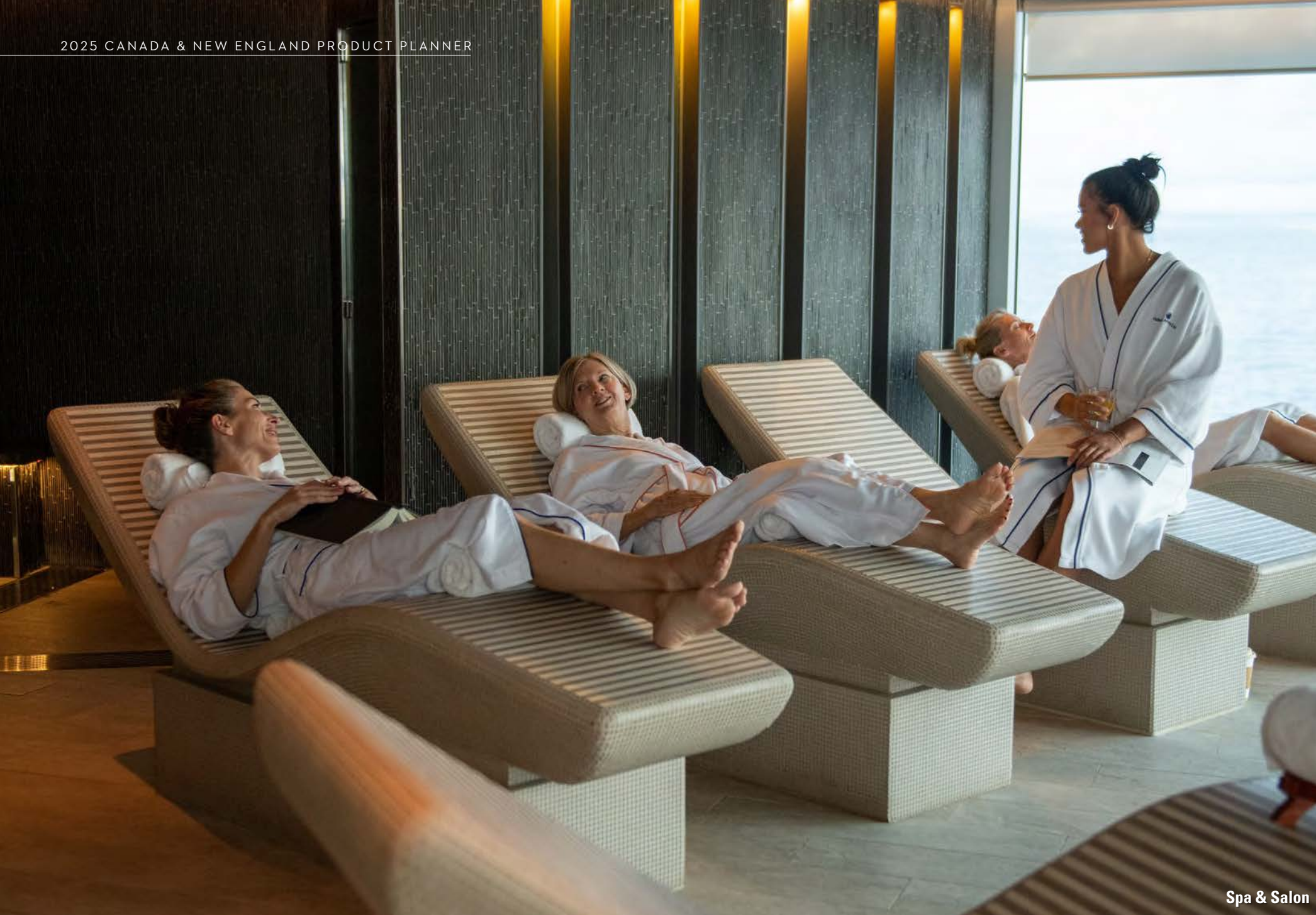
Spa & Salon