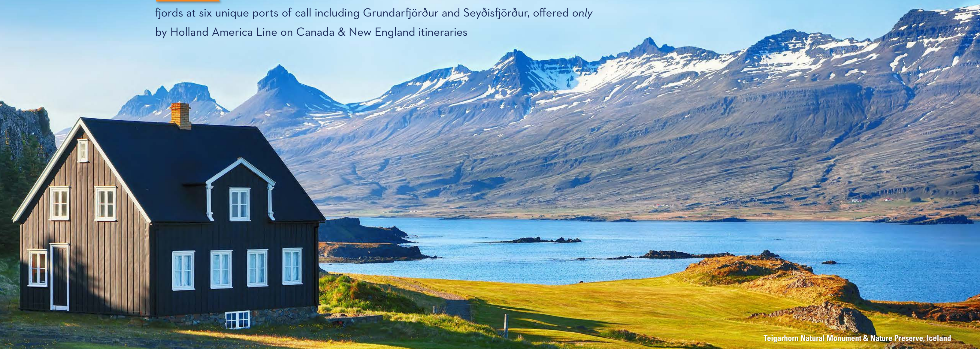
Teigarhorn Natural Monument & Nature Preserve, Iceland