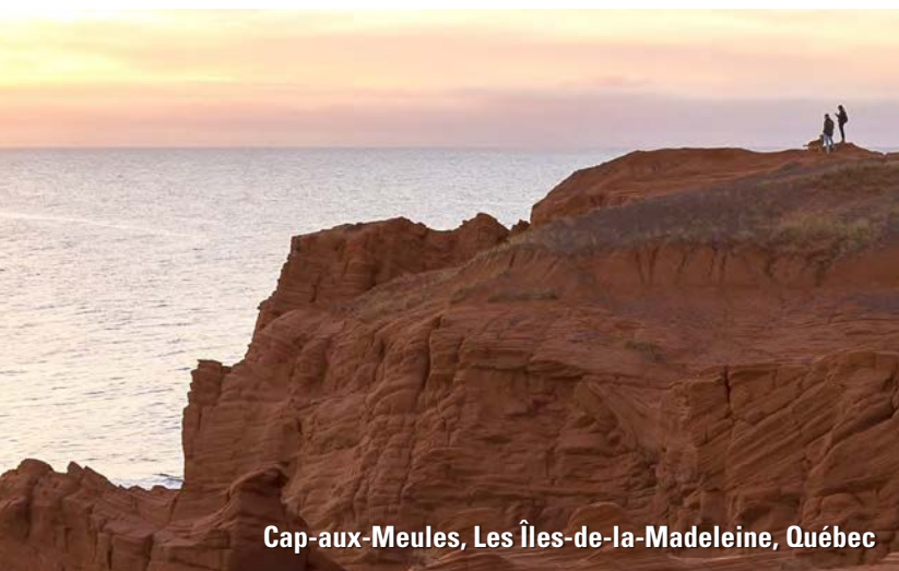
Cap-aux-Meules, Les Îles-de-la-Madeleine, Québec

Did you know that the 1781 "Siege of Yorktown" is widely considered the decisive battle that led to the American Continental Army's victory over the British? Admire Yorktown's lovingly preserved colonial homes and historic battlefields or transport yourself back to the 18th century in Colonial Williamsburg – the U.S.'s largest outdoor educational living museum that keeps alive the story of American independence.