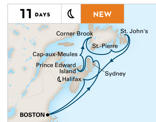
11 DAYS NEW CANADA & NEW ENGLAND CIRCLE: ACADIA & NEWFOUNDLAND ROUNDTRIP BOSTON