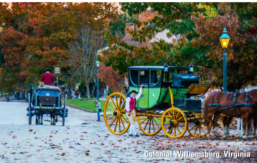
Colonial Williamsburg, Virginia

Explore further afield in two very different destinations. Immerse yourself in the United States' colonial history in Yorktown (Williamsburg), where lovingly restored and preserved structures, sites, and stories document the tales and triumphs of the American Revolution. In Cap-aux-Meules, soak in Les Îles-de-la-Madeleine's enduring heritage and quintessential charm.