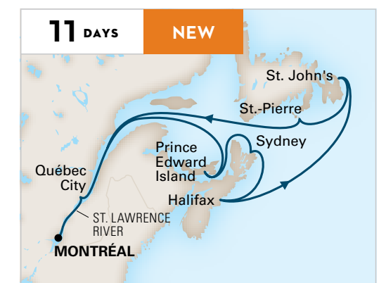
11 DAYS NEW CANADA & NEW ENGLAND CIRCLE: NEWFOUNDLAND & MONTRÉAL ROUNDTRIP MONTRÉAL