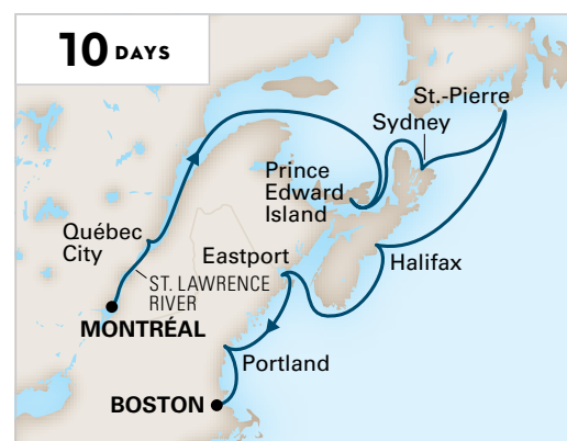
10 DAYS CANADA & NEW ENGLAND: MONTRÉAL, NEW FRANCE & MAINE MONTRÉAL TO BOSTON