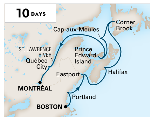
10 DAYS NEW ENGLAND, NEW FRANCE & NEWFOUNDLAND: CORNER BROOK BOSTON TO MONTRÉAL