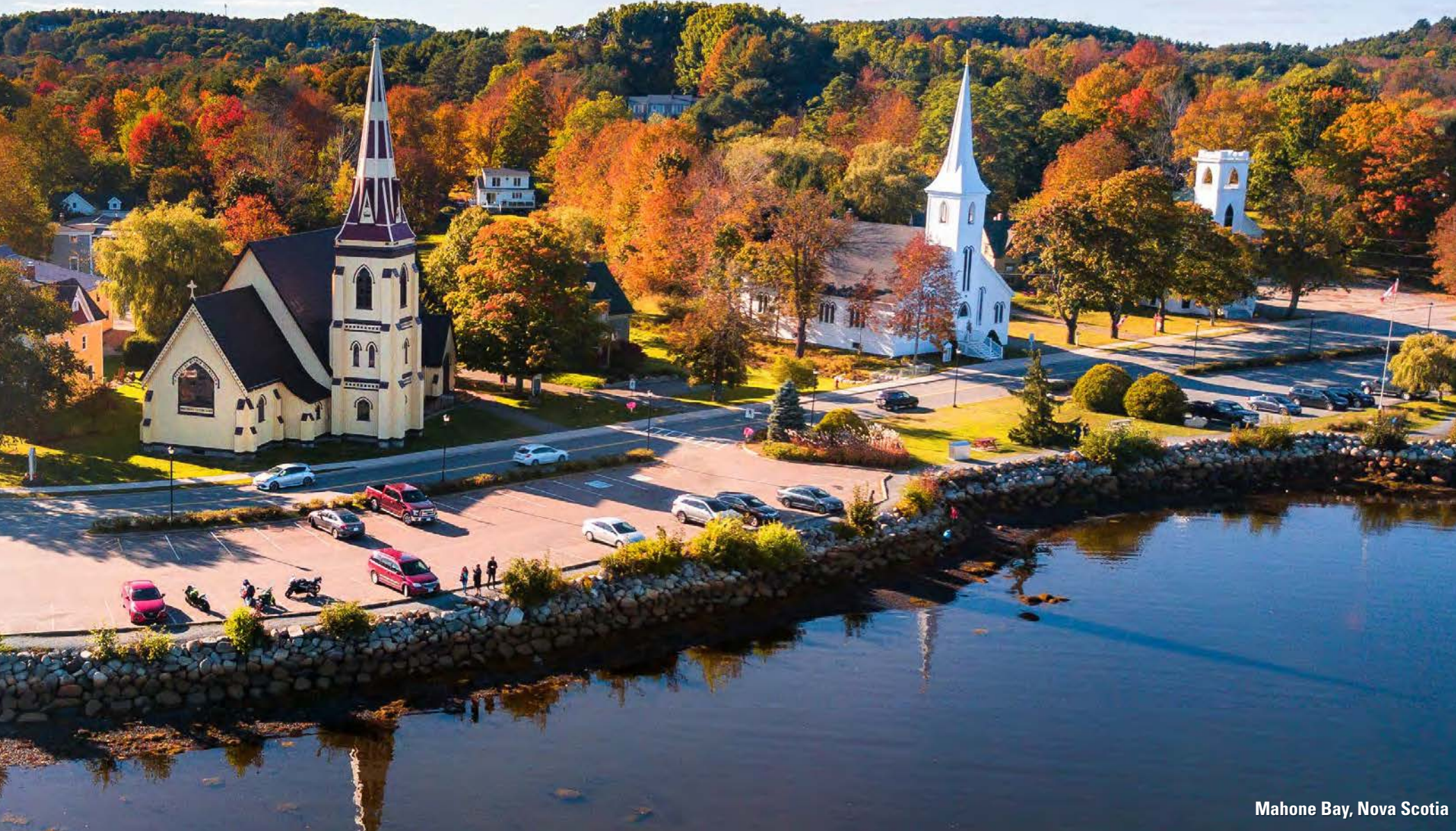
Mahone Bay, Nova Scotia