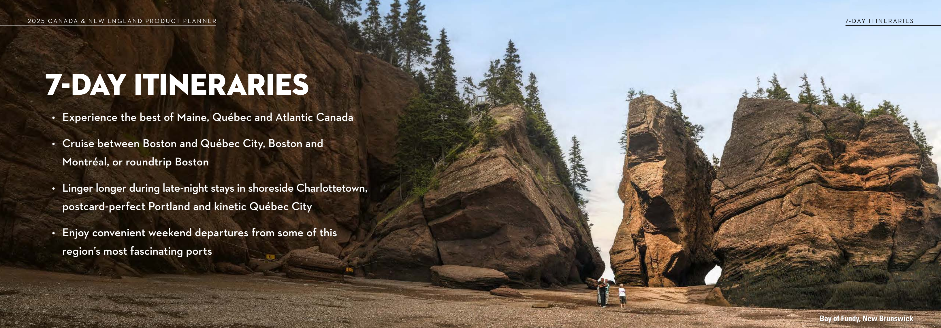
Bay of Fundy, New Brunswick